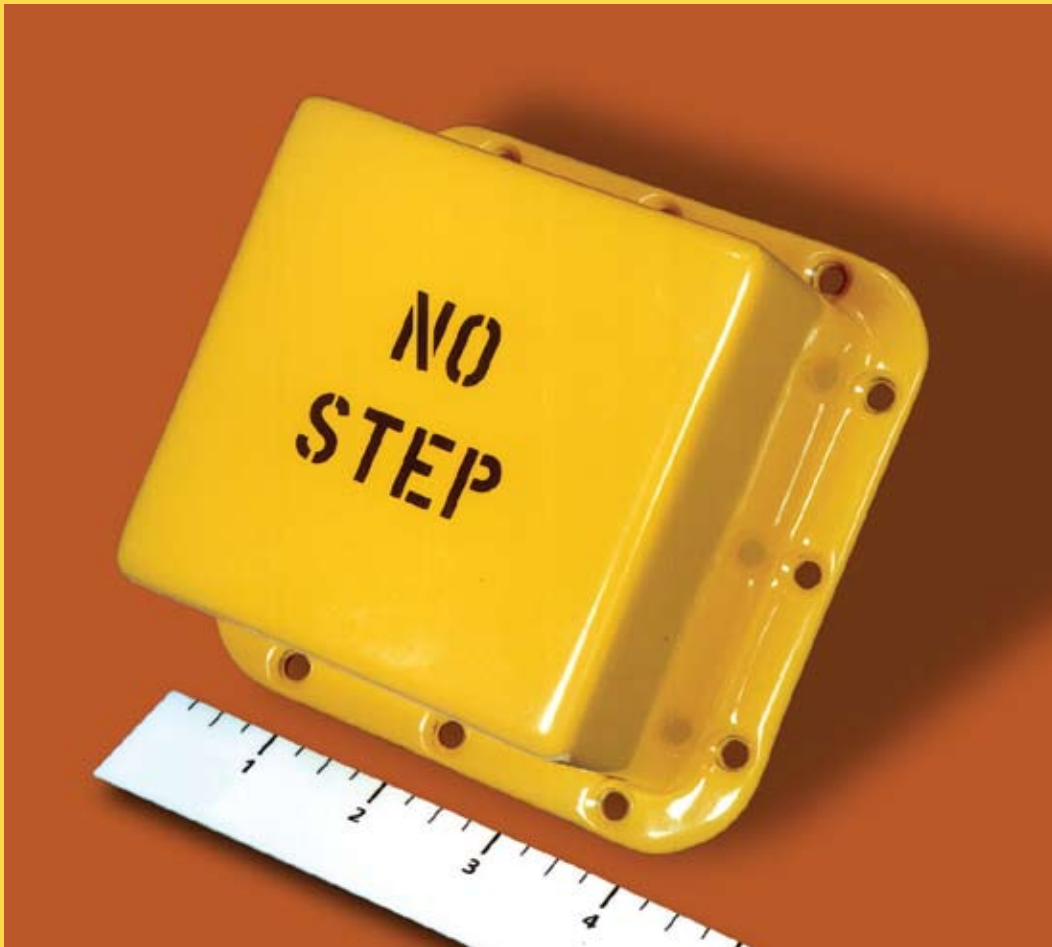
Figure 4: LEAN™ Adaptive Antenna Nulling Array

ZA combined adaptive interference cancellation with narrowband spread spectrum signal processing techniques to develop and integrate into antenna test range equipment the new capability to significantly reduce antenna range multipath. This system enables the accurate measurement of microwave antenna/array patterns having extremely low sidelobe levels.